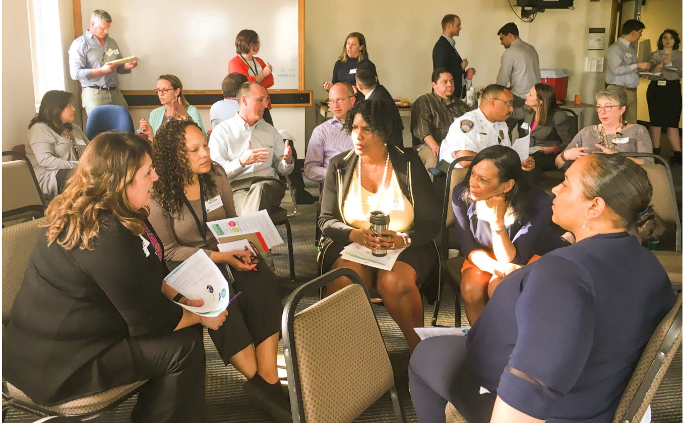
Staff from the City of Tacoma, many of whom were interviewed for the project, deliberate after being presented with initial student findings.