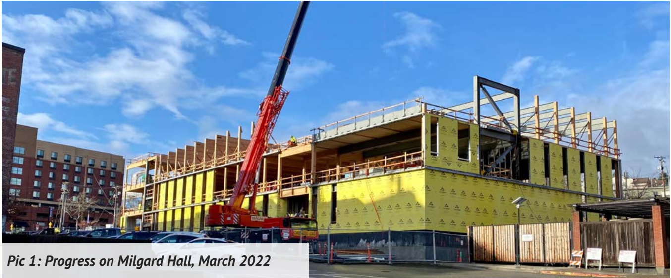
Pic 1: Progress on Milgard Hall, March 2022