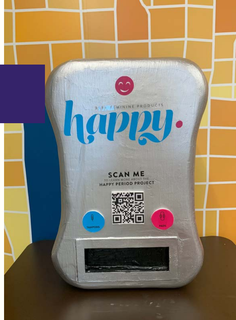
Pic 7: Happy is a vending machine that dispenses free feminine products using an app.

The team plans to continue their project outside the scope of the class and work to implement their design on campus. They are currently working to secure funding and a project sponsor.