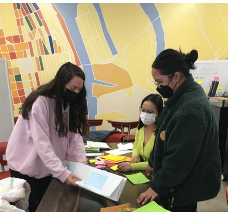
Pic 9: Students in TGID 320 work to build their prototype of a map to aid Afghani refugees relocating to the Seattle area.