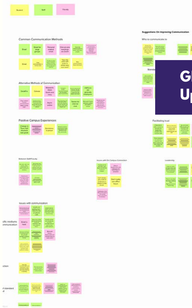
Pic 6: Affinity mapping on Mural to analyze high level, recurring themes from user interviews.