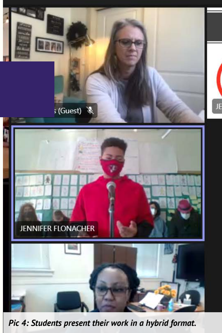
Pic 4: Students present their work in a hybrid format.

Stay tuned for more projects with this partnership!