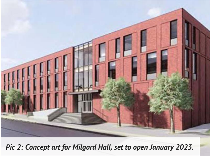
Pic 2: Concept art for Milgard Hall, set to open January 2023.

With the expanded space, our new Lab will feature two design labs, community workshop space, and dedicated cubicles for focused project work for students and community partners. We will have a welcoming front desk and staff offices. The GID Lab team is excited to expand innovation and design at UW Tacoma, and continue to foster " a world of ethical and creative problem solvers "!