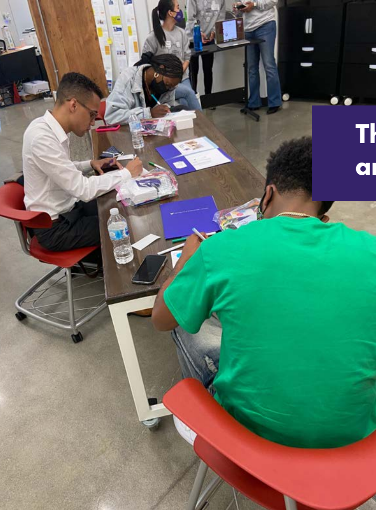
Pic 8: Student designers work to reimagine Dr. King's dream in their lives, as part of the Institute for Black Justice 2021 Freedom Summer Symposium.