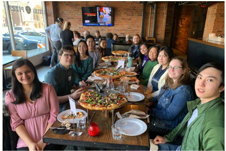
Pic 3: Group photo with students and alumni before digging in to the delicious pizza at Zeeks!

The IIGE team looks forward to hosting another alumni lunch in future quarters!