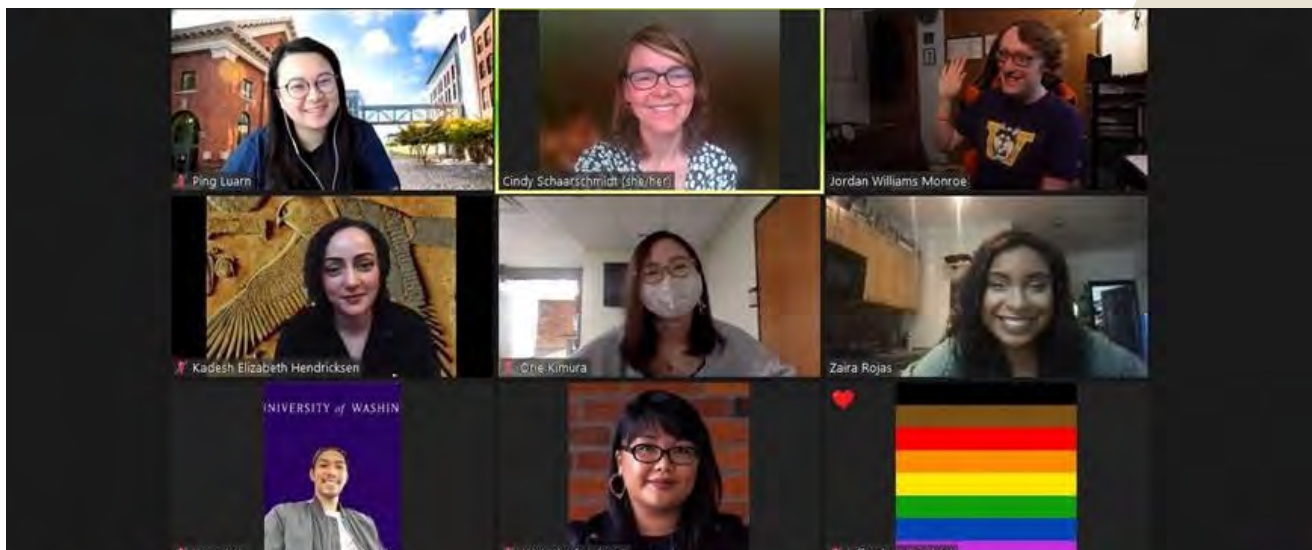
Screenshot of the Living and Housing Worldwide meeting

During this past academic year, we combined two programs that we used to offer separately: UWTeaTime and Global Ambassadors. Students met virtually to discuss social justice topics of global and local significance and to build community among international and domestic students.