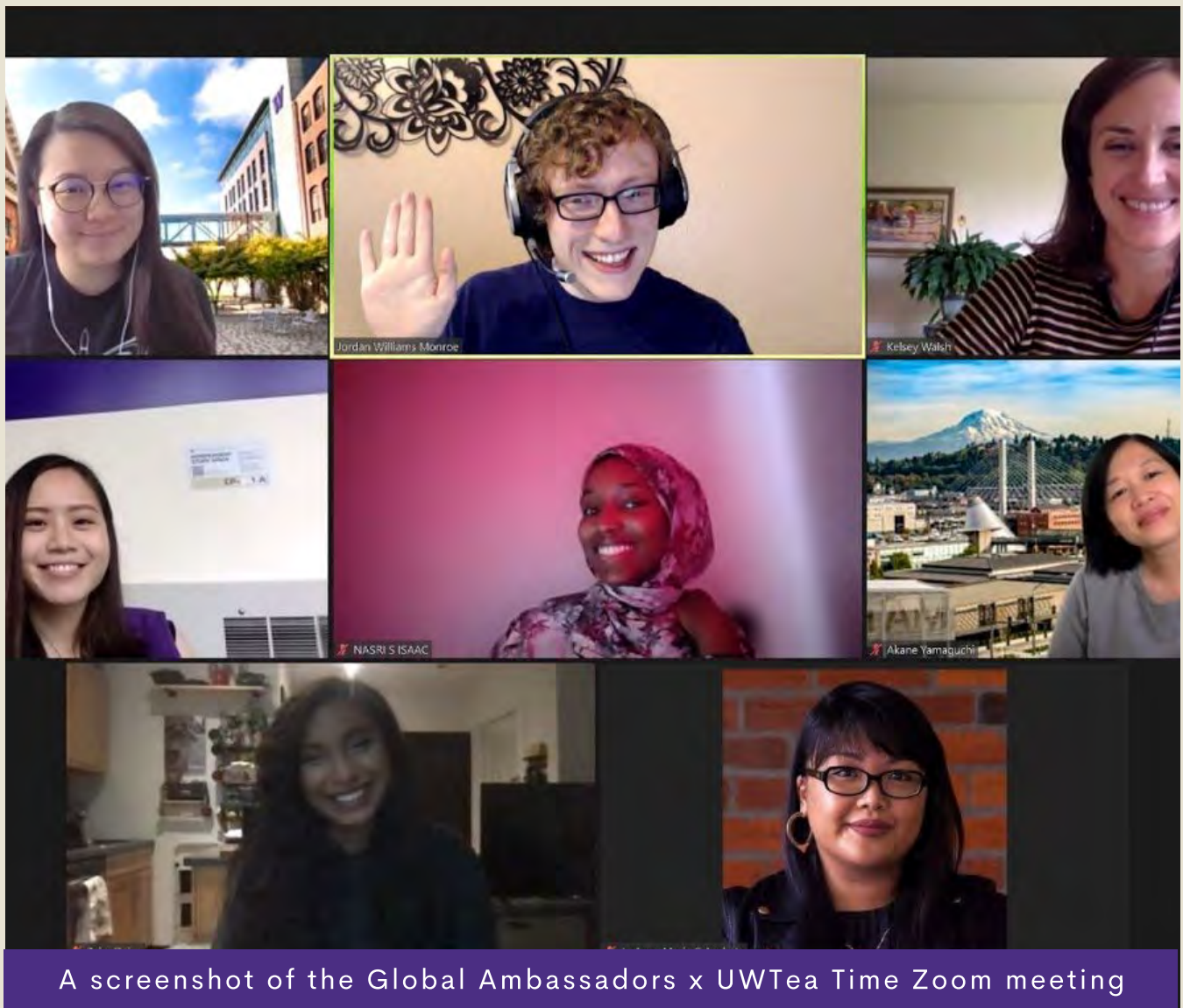
A screenshot of the Global Ambassadors x UWTea Time Zoom meeting