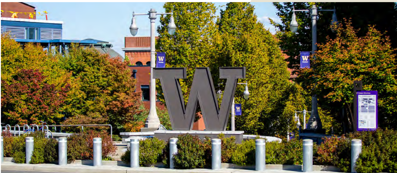
A picture of the UW Tacoma's "W sign"