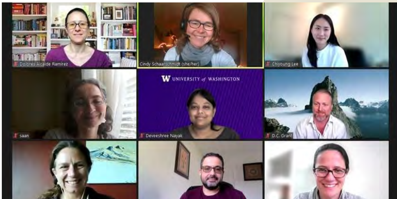
Screenshot of a UW Tacoma & UW Bothell COIL Fellows meeting