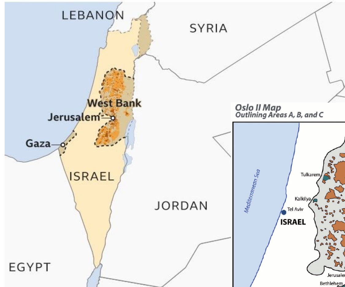
Oslo II Map Outlining Areas A, B, and C