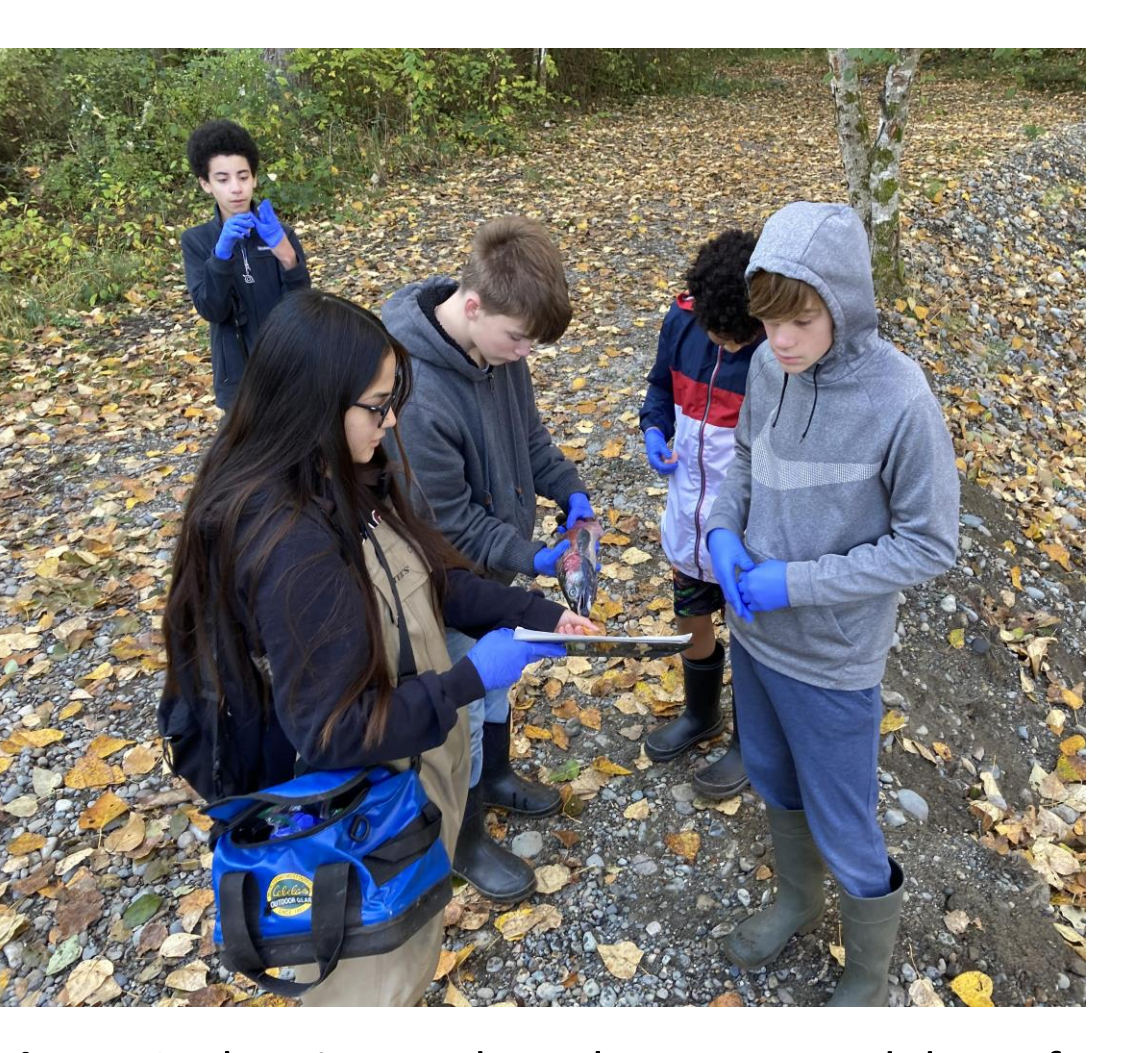
Figure 6. Showing students how to record data of deceased Coho salmon.