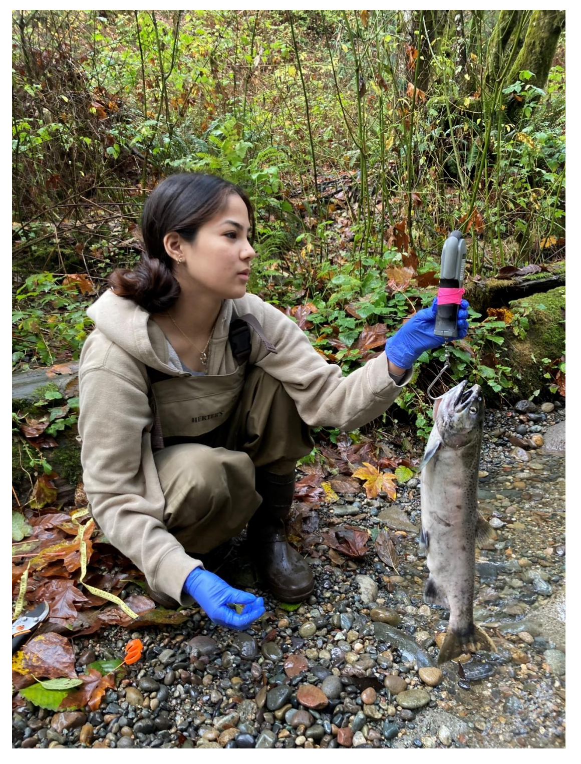
Figure 1. Weighing mass (kg) of deceased Coho