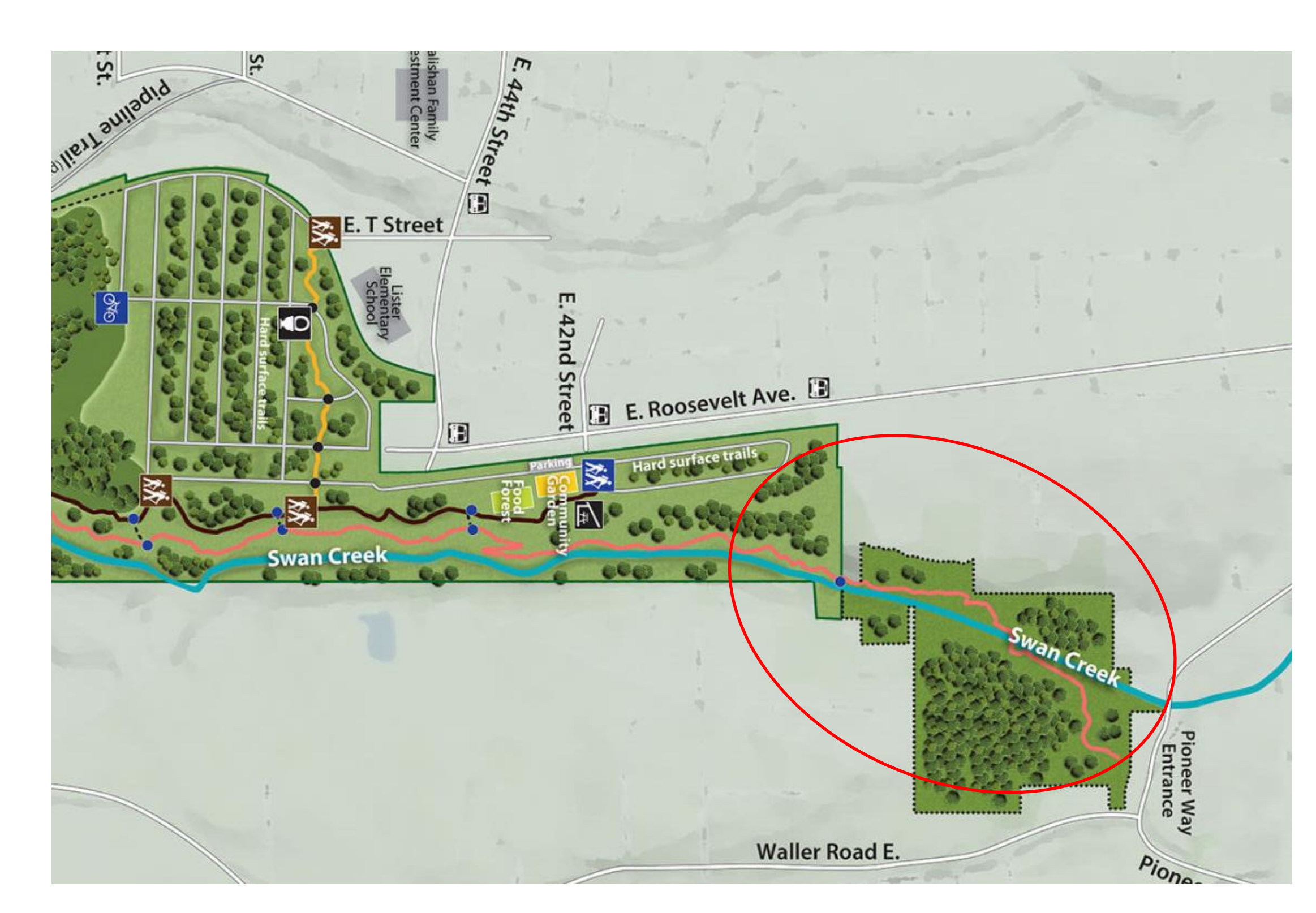
Figure 2. Map of Swan Creek in Puyallup, WA. Survey site circled in red.