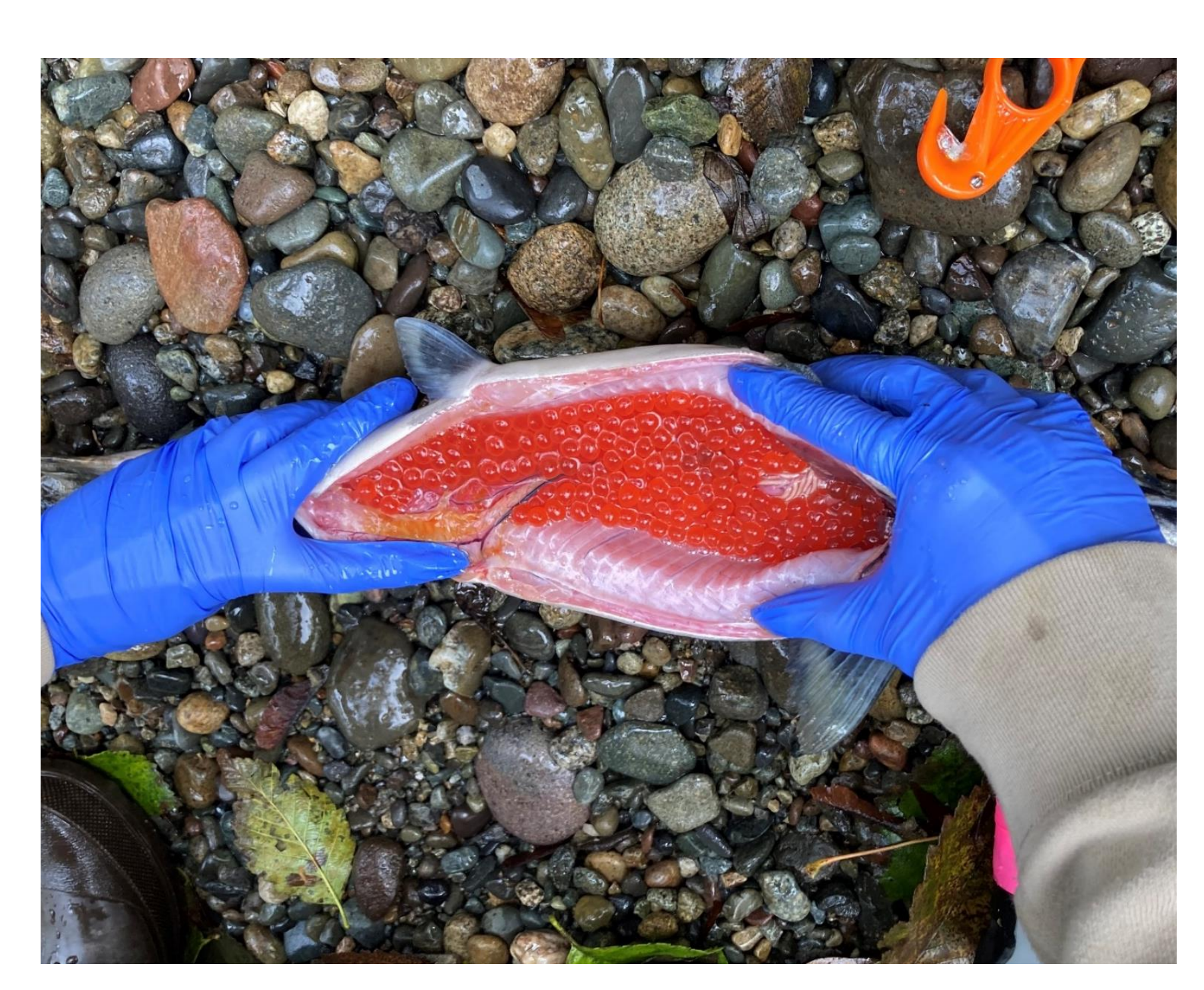
Figure 3. PSM evident female Coho salmon (no signs of predation)