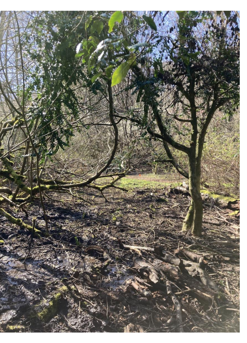
Figure 8: Pruned boxwood.