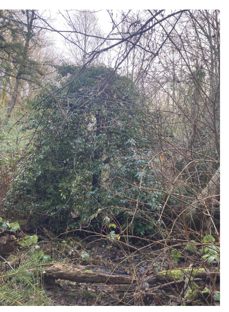
Figure 4: Polygon 3 before.