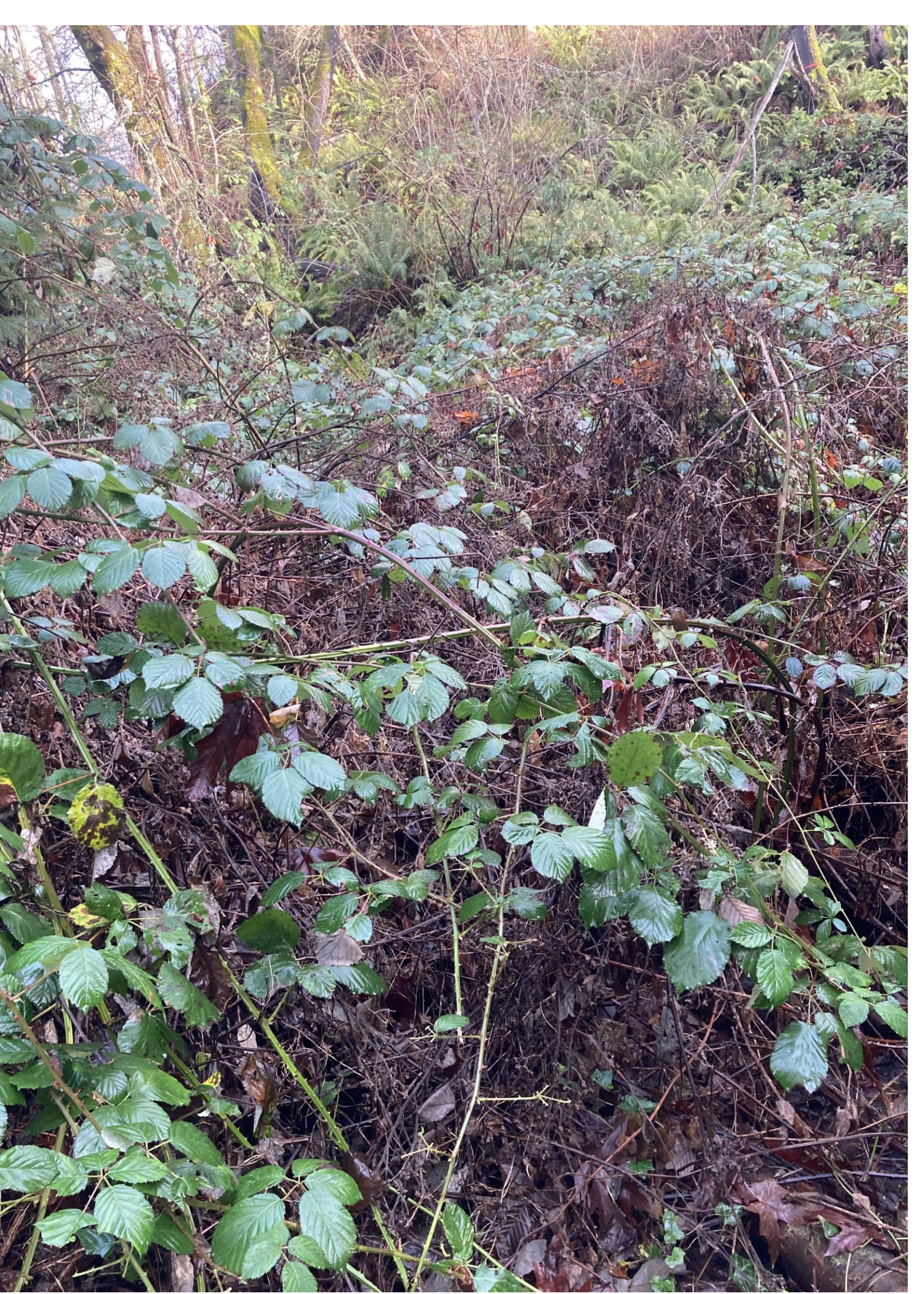
Figure 1: Polygon 4 before.