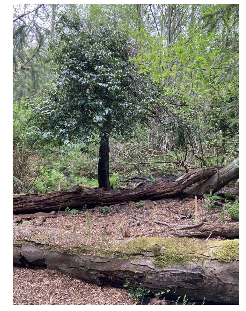
Figure 5: Polygon 3 after.