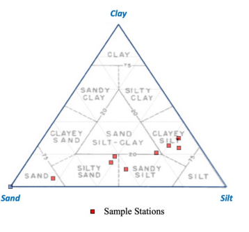
Figure 1. Particle size distribution of samples analyzed within Elliott Bay Summer 2023.