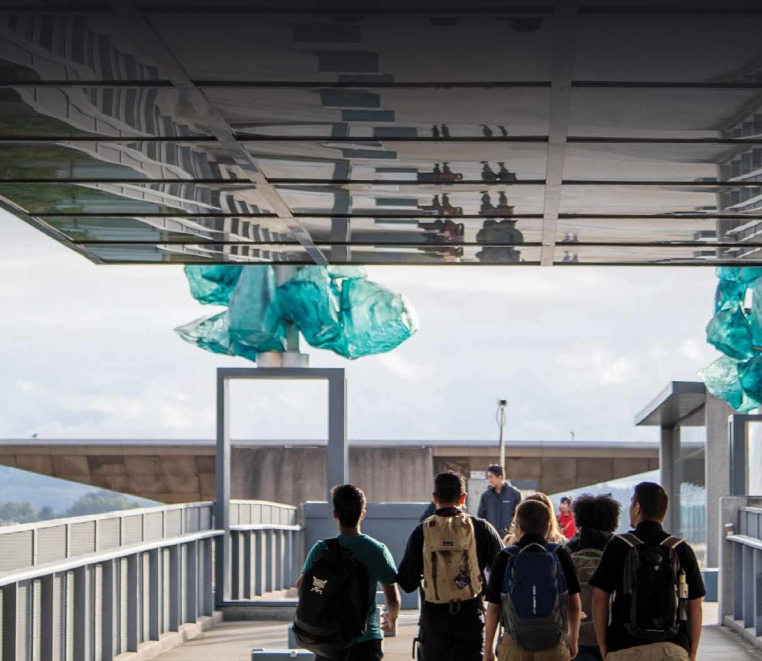
Beleqsa Tamaami Global Honors '16

“ I’m really interested in seeing how local and national issues like education play out on a global scale. ”