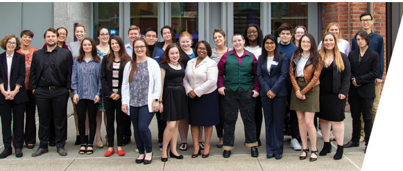
Graduating cohort of 2019 celebrates the Global Engagement Conference

Applications may be completed online tacoma.uw.edu/iige/global-honors-application or submitted in hard copy to: